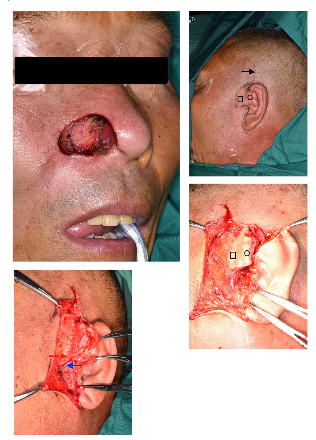
Fig. 1. (A) An alar defect after tumour removal. (B) Clinical image of the donor site: the pretragal incision line (black arrow), the pre-auricular skin (rectangle), and the root of the helical rim (circle). (C) The pretragal skin flap in the plane above the superficial temporal vessels was raised and the superficial temporal vessels were exposed through blunt dissection. Red arrow, the superficial artery; blue arrow, the superficial vein. (D) The flap was raised in a plane deeper than the superficial temporal vessels. Rectangle, the pre-auricular skin; circle, the root of the helical rim.

the graft vessel and the recipient vessel for the repair of nasal alar defects after oncological ablation. This report proposes a relatively simple microsurgical method for reconstruction of the nasal ala to facilitate the task of the reconstructive surgeon.