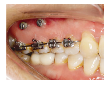
Fig. 3 Application of partial appliances to solve the potential problems of molar tipping and premolar crowding after molar intrusion if necessary

Heavier forces of 200 to 300 g were recommended in the corticotomy case combined with mini-implant anchorages<sup>[32, 33, 35]</sup>. In an experimental study Carrillo et al <sup>[25]</sup> confirmed that constant forces differing from 50 to 200 g had no significant effect on the amounts of premolar intrusion. Another study by van Steenbergen et al <sup>[38]</sup> also showed that there was no significant difference between the 40 and 80 g force groups after intrusion of the maxillary anterior teeth. Their studies indicated that teeth intrusion was time-dependant and force value did not affect the rate of intrusion.