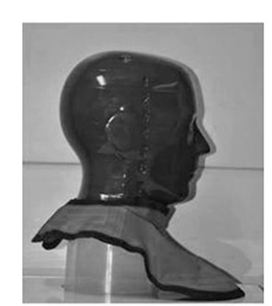
One collar on the front neck