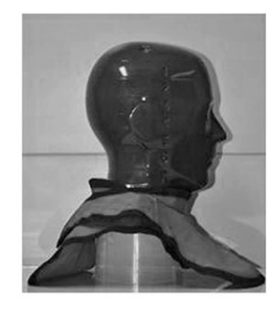
Two collars on both the front and back neck

Figure 2 Photo of the thyroid collar and the placement of thyroid collars around the neck of phantom