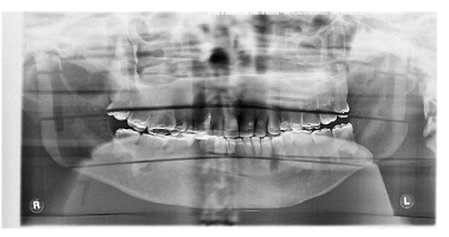
Figure 3 A sample image of the phantom

dose, p = 0.482 for the total effective dose). Similar results were obtained for the panoramic machine Orthophos CD.