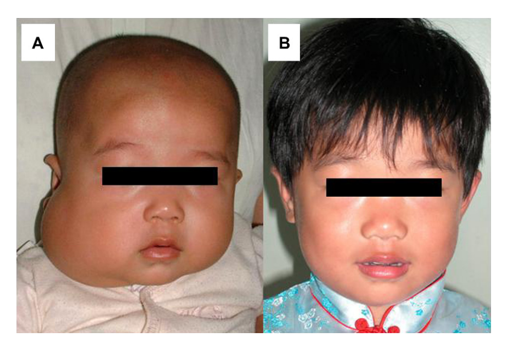
Fig. 1. Representative case of a 4-months boy with lymphatic malformations in the region of right face and neck. The patient was treated with pingyangmycin in combination with triamcinolone acetonide for 2 years. The facial appearance looks symmetric 5 years after treatment. A: Before treatment; B: after treatment.

Pingyangmycin was injected into the lesion using a 7-gauge needle in a fan-shaped direction. In the experimental group, triamcinolone acetonide was usually injected some time after the injection of pingyangmycin and especially into the hardened areas of pingyangmycin-induced fibrosis or inflammatory response. Later, pingyangmycin could be injected into the softened area again to destroy the remaining diseased lymphatic vessels. The total injection time for triamcinolone acetonide was about half of that of