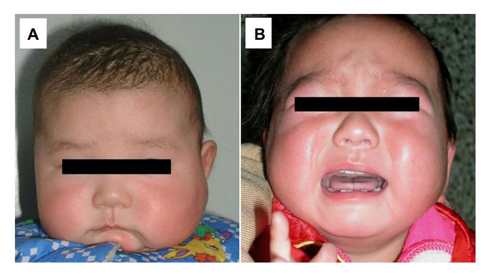
Fig. 2. Representative case of a 6-months boy with lymphatic malformations in the region of left face. The patient was treated with pingyangmycin in combination with triam-cinolone acetonide. Facial appearance looks symmetric and shows no any sign of facial nerve injury 2 years after treatment. A: Before treatment; B: facial expression after treatment.

pingyangmycin. For macrocystic lesions the lymphatic fluid was aspirated prior to injection of pingyangmycin, while for microcystic lesions pingyangmycin was injected directly into the lesions.