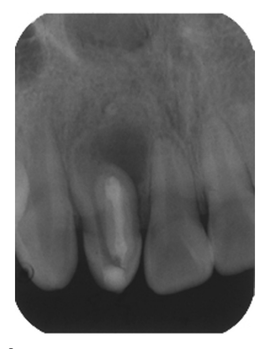
Figure 3. After 4 weeks of consecutive irrigation and medication, the patient was asymptomatic. The invagination was fully obturated by GuttaFlow, which is radiopaque.

was thoroughly radiopaque (Fig. 3). After irrigating the main root canal with 2.5% NaOCl and normal saline and drying the canal with paper point, periapical tissues of the main canal were irritated by #30 K-file, but bleeding was not evoked; there was no blood found in the root canal orifice except on the tip of the file. After 10 minutes, no more bleeding was observed, and the accessed cavity was sealed with Fuji IX glass ionomer cement (Fuji Corporation, Osaka, Japan), followed by adhesive composite resin (Filtek Z250; 3M ESPE).