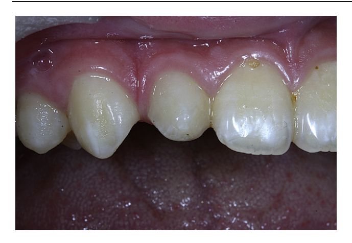
Figure 1. The crown of maxillary right lateral incisor was cone-shaped without caries.

numbers of clinicians have used pulp revascularization for the treatment of immature permanent tooth with periapical periodontitis and had ideal results; they believe that this conservative approach may substitute for the traditional apexification as the preferred treatment method for the immature tooth with periapical periodontitis and sinus tract (19).