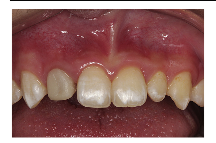
Figure 5. After treatment reached ideal result, the tooth was restored to normal shape with adhesive nanocomposite resin. Because the crown of the dens invaginatus had been discolored by triple antibiotic paste, the treated tooth was darker in color than the adjacent ones.

periodontitis before the completion of root development or apical closure.