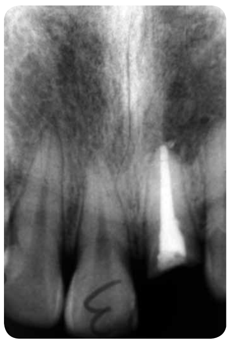
2 Radiograph of fractured tooth.