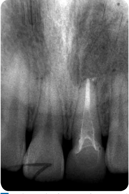
6 Radiograph of incisor after 8 months.

the core portion was modified slightly for definitive crown preparation. The root canal was cleaned with 75% alcohol to eliminate remnants of the articulating paper and air dried. The post and core was rinsed with ultrasonic cleaner (VS 350; Silfradent Srl, Santa Sofia, Italy), and then the bonding surface was conditioned (Super-Bond C&B Monomer; Sun Medical Co, Ltd, Moriyama, Japan). The post and core was cemented into the root canal using a resin cement (Super-Bond C&B; Sun Medical Co, Ltd), according to the manufacturer's instructions. After the resin cement was polymerized, the tooth was pre-