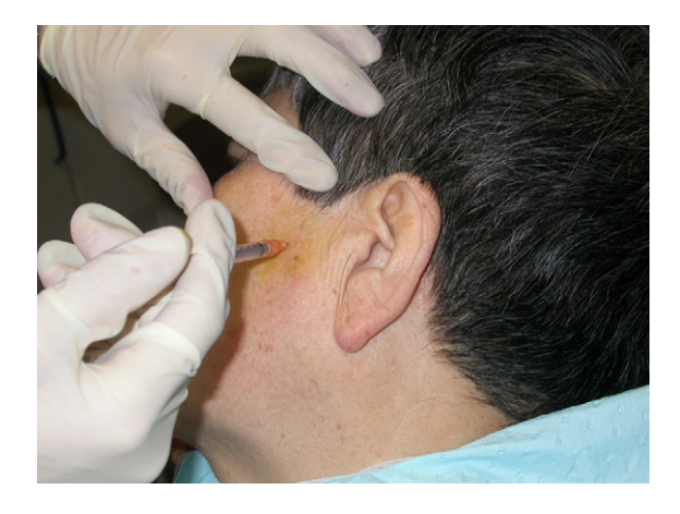
Fig. 3. Photograph of injection of botulinum toxin type A about 1 cm below the central zygomatic arch.

reduction of the dislocation by manual repositioning of the condyle. One patient only reported one dislocation on the second day after injection. All treatment was successful, and there were no recurrences and no need for further injection during follow-up of 3 months to 2 years.