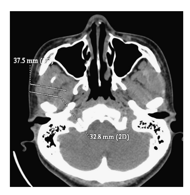
Fig. 1. Axial computed tomogram under the zygomatic arch showing measurement of the position of the lateral pterygoid muscle. The two lines show the depth of the needles and the path of the injections.

Four patients were diagnosed with bilateral habitual dislocations and one with unilateral dislocation. Injections of BTX-A 25–50 units/muscle at the two sites were given after