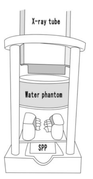
Figure 1 Schematic of the geometry for exposing test radiographs. SPP, storage phosphor plate

The SPPs were then scanned immediately after exposure with the Digora<sup>®</sup> FMX scanner employing the proprietary software DfW v2.5, the Digora<sup>®</sup> Optime employing the proprietary software DfW v2.5 and the Dürr VistaScan<sup>®</sup> using the proprietary software